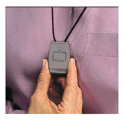
A Key to Peace of Mind and Independent Living